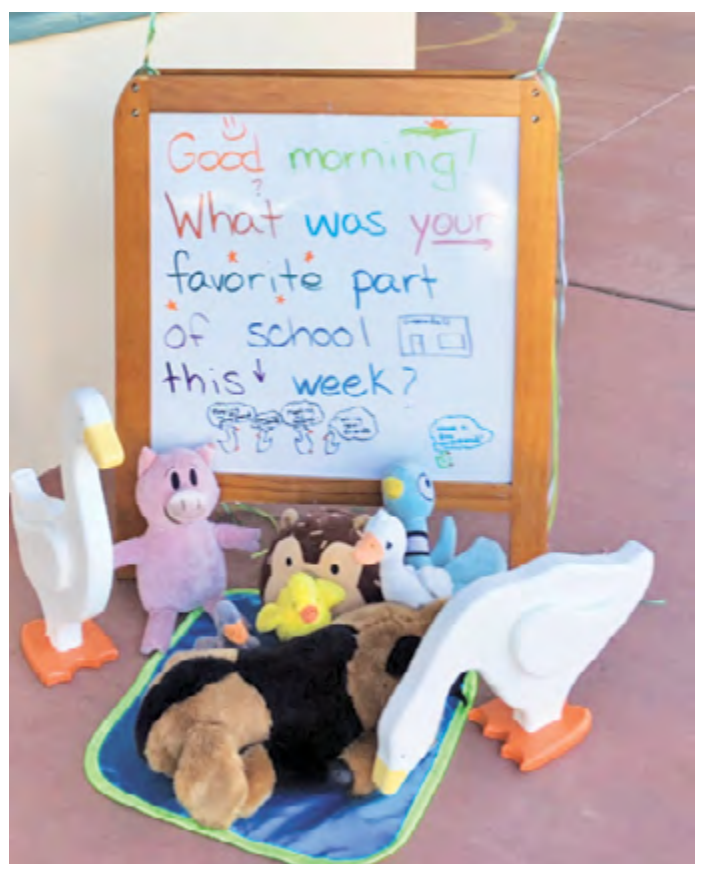
Greendell Goslings Greeting Friends

Welcome back to school! Our Greendell School Goslings greet our students and their families each morning with a message that welcomes families as they arrive at school. We believe that engaging our students and families in their education builds and strengthens our school community. One of the core values of the PAUSD Promise is: Preparation for college and career begins with attendance and appropriate behavior.