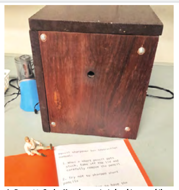
In Room 20, Genius Hour is a protected and treasured time for our learning community. For about an hour a week, students pursue learning projects of their own design, driven by their passions, and curiosities. It allows students to go deep into a topic that excites and inspires them. Pictured is a student-created noise canceling pencil sharpener case.

Whether it be our youngest friends in kindergarten, or our oldest ones in 5th grade, every child at Palo Verde has a voice to be heard and valued. We are teaching children how to self-advocate, reflect, and dig deep. Our teachers plan with an intention and purpose. They work closely with one another to develop strategies and lessons that honor the individuality of each student.