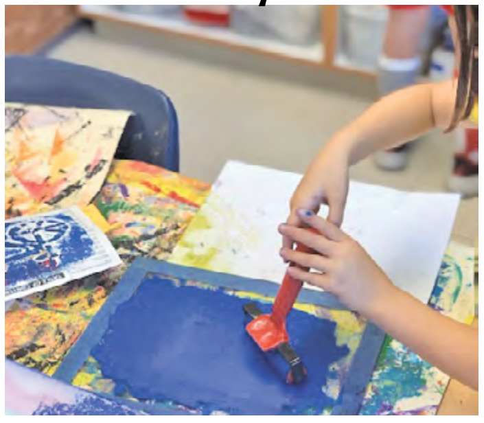
Spectra Art Lesson