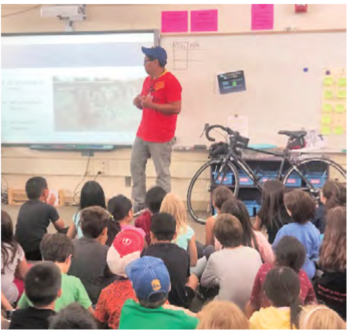
3rd Grade Bike Rodeo